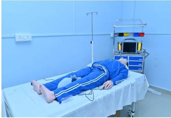
Govt. Medical College & Hospital, Dharashiv - Skill lab